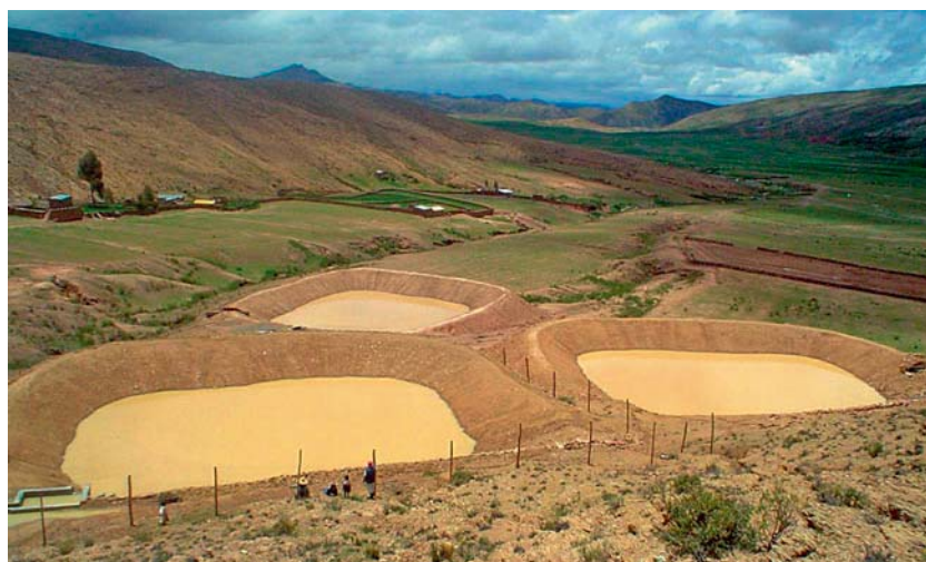
Farmers watching the construction of atajados in Berengela, Department of Potosí

First of all, it has to be guaranteed that the water harvesting system functions and will do so for at least 12 or 15 years. Most problems are caused by extremely high losses of water due to exfiltration. If the 'atajado' shows high exfiltration rates after the first period of filling, it has to be made impermeable with clay. It is also the duty of the implementing organization to make sure that all installations like pipes, valves etc. are completed and functioning. As the farmers mainly live far away from the next town, they do not have the possibility to buy and complete lacking or damaged material themselves. The organization should not only provide all the material, but supervise and monitor the installation. , Secondly, it is very important to ensure a high productivity of the agriculture