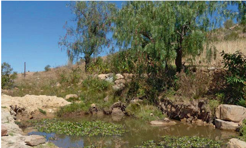
Rustic water harvesting system in the south of the Department of Cochabamba