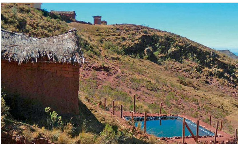
Water harvesting system with permanent water source in Toro, Department of Potosí

However, there are also regions, where there are no permanent water sources at all and watersheds and springs are only filled in the rainy season. In this case, the construction of so called 'atajados' has become quite popular. 'Atajado' means 'embanked' and describes a big earthen reservoir on a slope that collects the surface run off of the rainwater from a prepared catchment area (3-5ha) above the reservoir. The construction typically consists of a simple earthen ditch dug with spade to collect the run off. Some technically more ambitious constructions additionally consist of an open concrete channel that leads the water into the reservoir (including a retention basin for sediments), a concrete overflow and a drainage with long tube that ends in a valve to be connected with hosepipes for the irrigation system in the field (min. 0.2ha, max. 1ha) or a drinking trough for cattle. Often, a ring fence prevents children from accidentally falling into the reservoir or the cattle damaging the construction. Since organizations have started to implement rain water harvesting projects with 'atajados' in the end of the seventies, the design has become more and more sophisticated and the storage capacity has increased from originally 300m 3 to maximum 4500m 3 . As experience has shown that big community or multifamily 'atajados' often cause conflicts regarding water rights